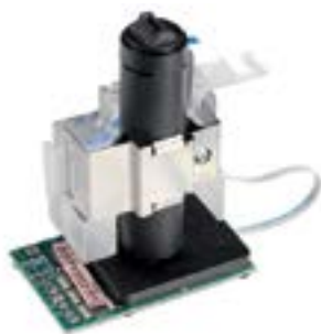
HP Optical Media Advance Sensor (OMAS)

HP Double Swath Technology provides breakthrough speed and performance. The HP Designjet Z6600 Production Printer includes two sets of three HP 771 and HP 773 Designjet Printheads, creating a wide print swath—up to 1.67 inches/42.5 mm—and a high firing frequency to deliver prints with amazing speed. Six bi-color printheads feature 1,056 nozzles per color, 1200 nozzles per inch, and small drop volumes for top photo quality.