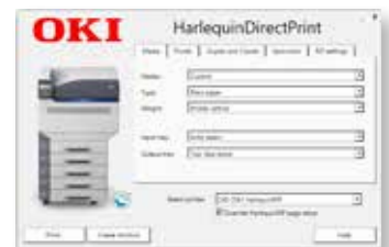
Harlequin MultiRIP 10