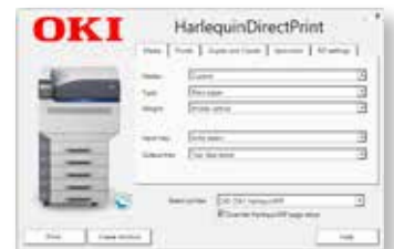
Harlequin MultiRIP 10