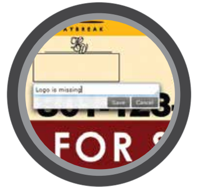
Automated Artwork Approval Tool